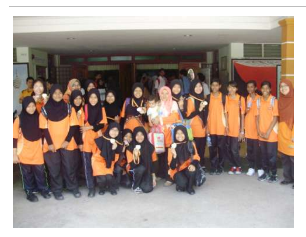
Negeri Sembilan State Level Chess Competition 2013