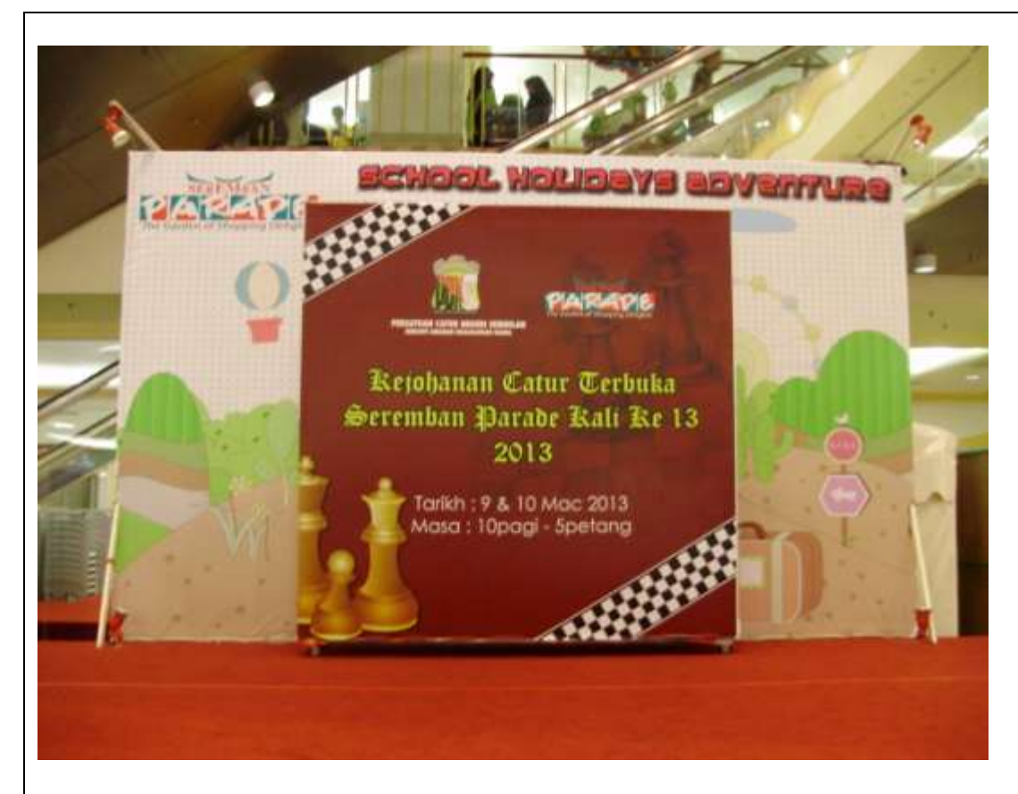
Seremban Parade Open Chess Championship 2013