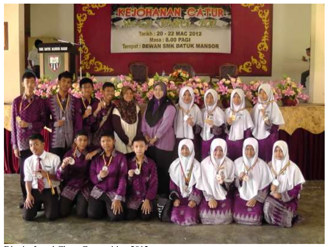
District Level Chess Competition 2012