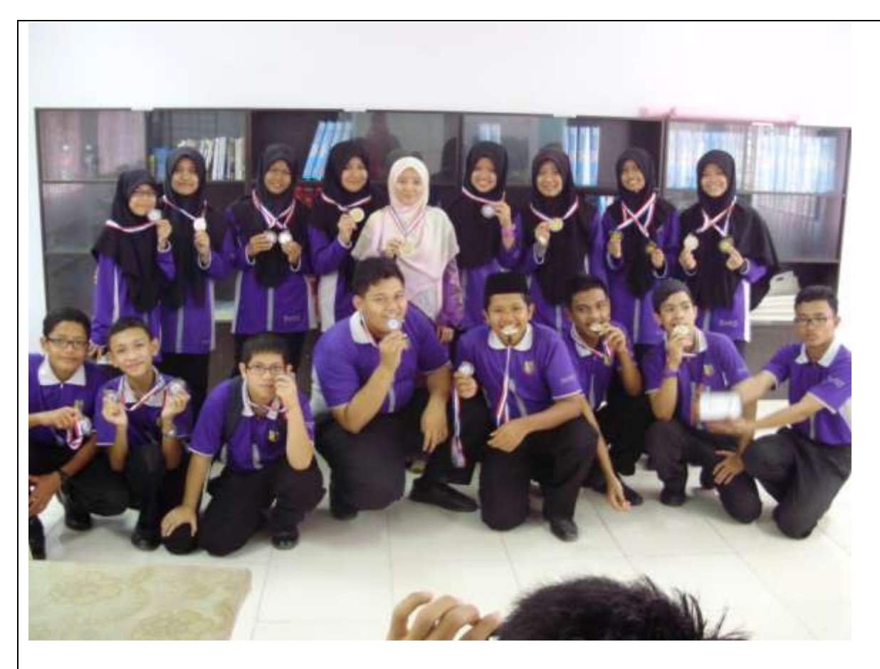
District Level Chess Competitioon 2013