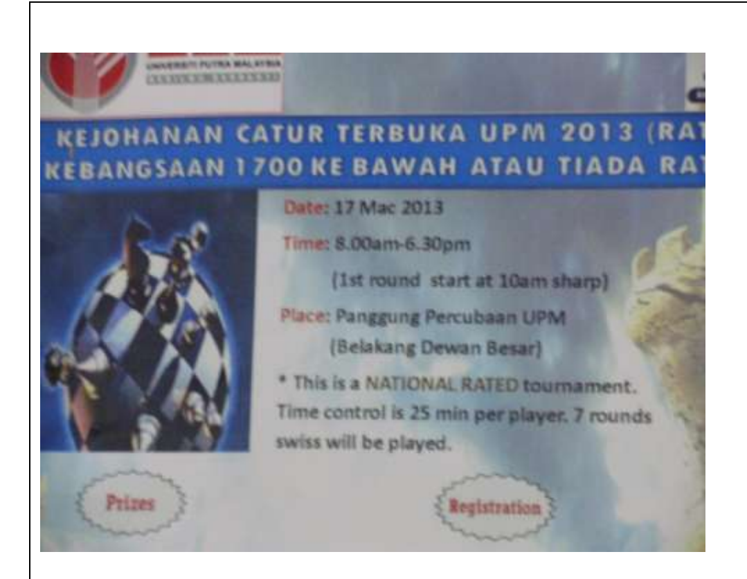
Universiti Putra Malaysia Open Chess Championship 2013