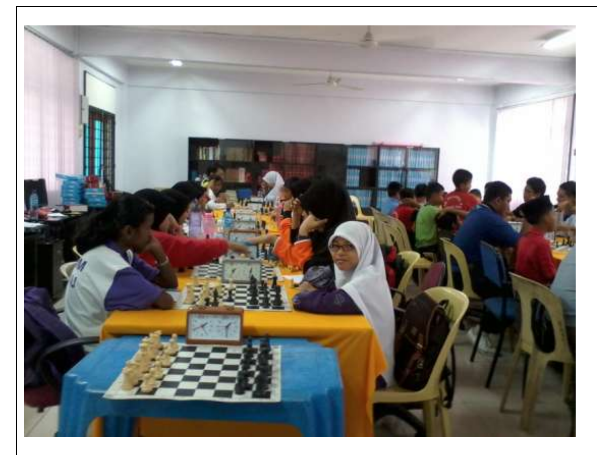
Chess Workshop- Sekolah Berasrama Penuh Integrasi jempol 2012